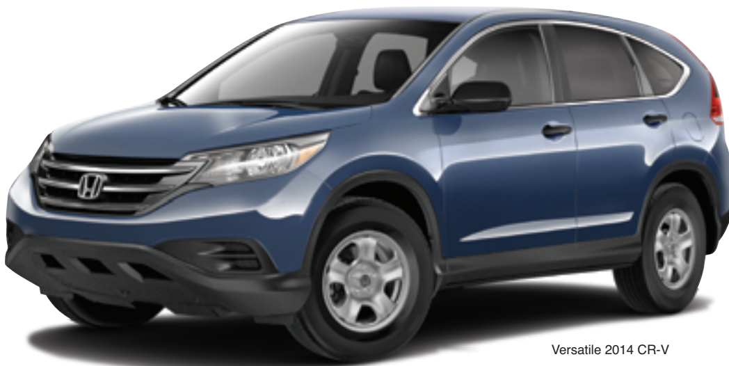
Versatile 2014 CR-V

2014 Hondas... You'll love them from every angle and every turn in the road.